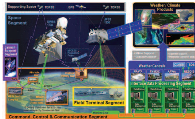
JPSS System Architecture